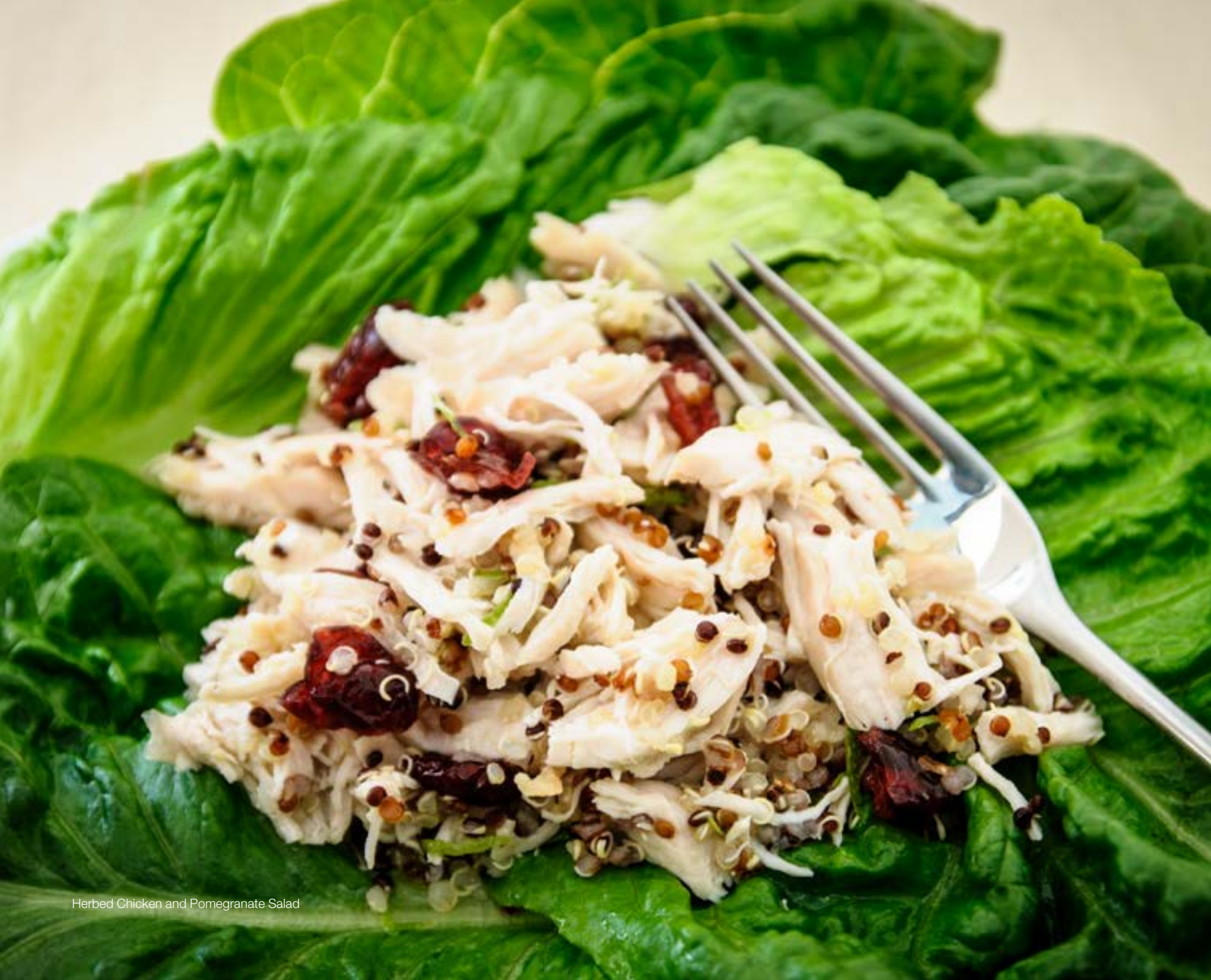
Herbed Chicken and Pomegranate Salad