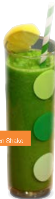
Vibrant Green Shake