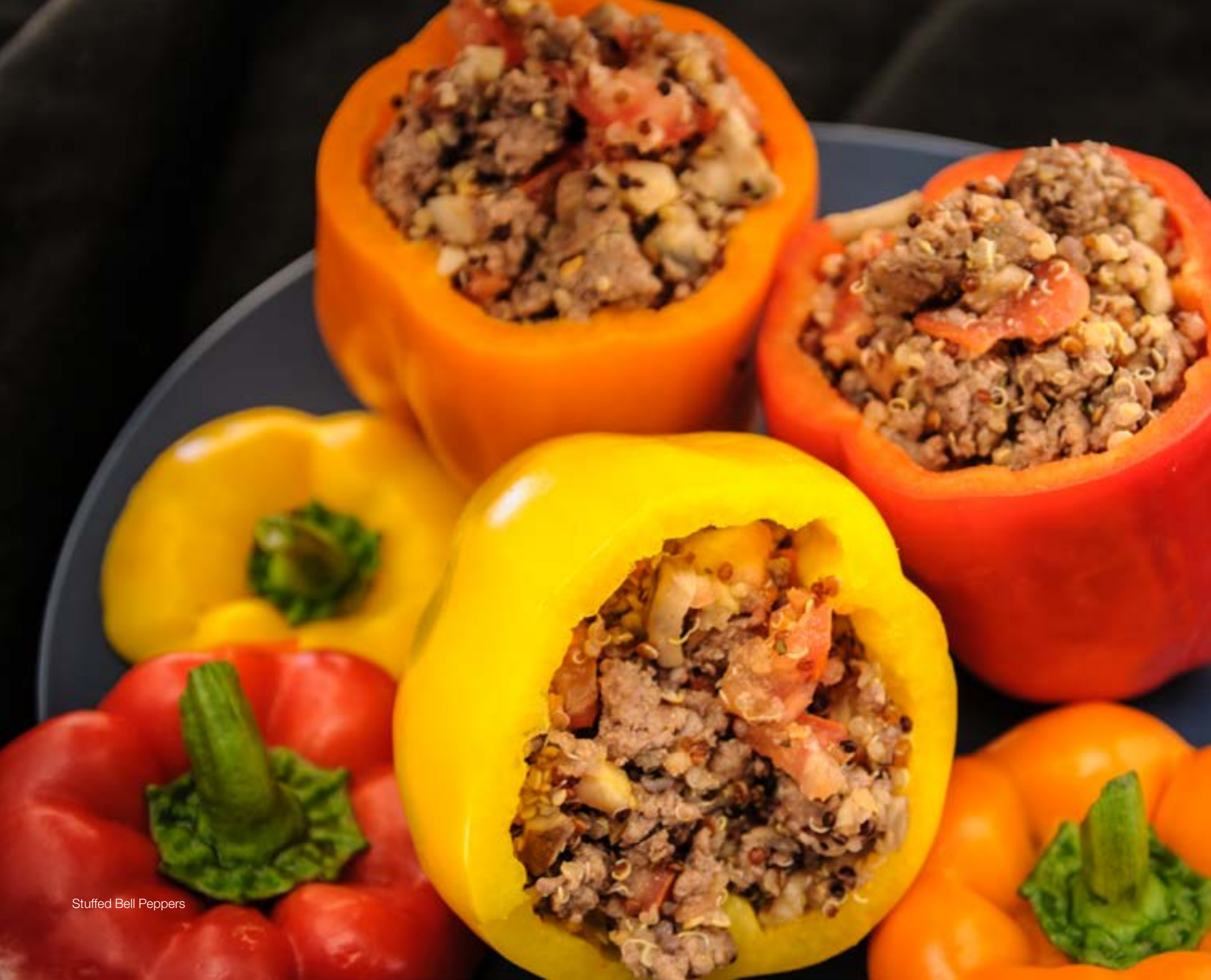
Stuffed Bell Peppers