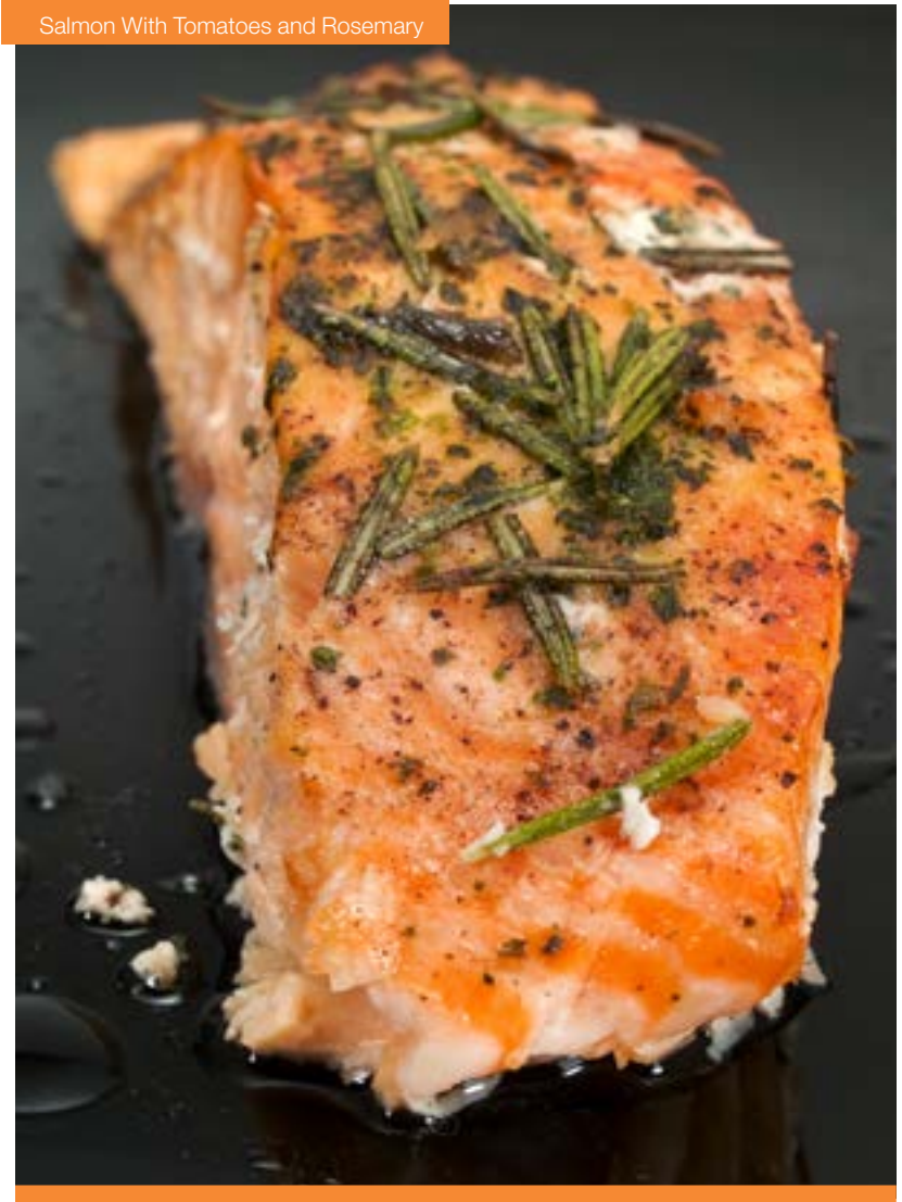
Salmon With Tomatoes and Rosemary

Preheat the oven to 475. Cut 4 pieces of nonstick aluminum foil, each 12 inches long. Rub each fillet with salt, pepper, 1 teaspoon oil, and \frac{1}{4} teaspoon lemon juice. For each packet, put 2 lemon slices in the center of the foil, top with salmon, a rosemary sprig, and 2 more lemon slices, then surround with chopped tomatoes. Draw up the sides of the foil and seal the packets well, leaving room around the ingredients so they can steam. Put packets on a baking sheet and bake 12-15 minutes or until the salmon is cooked. Spoon into soup plates and serve immediately. Serves 4.