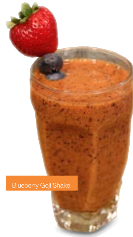
Blueberry Goji Shake

Blend all ingredients except the ice until smooth. Add the ice and blend again until frosty.