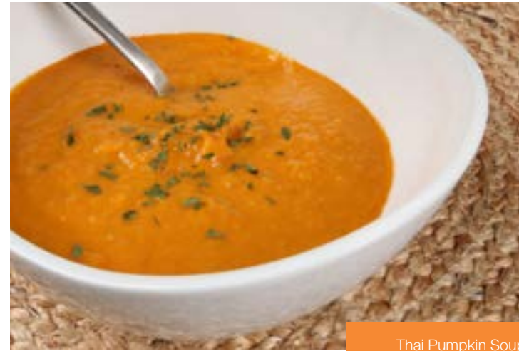
Thai Pumpkin Soup

Place all ingredients in a food processor and process until smooth. Cover and chill for 1 hour before serving. Serves 4.