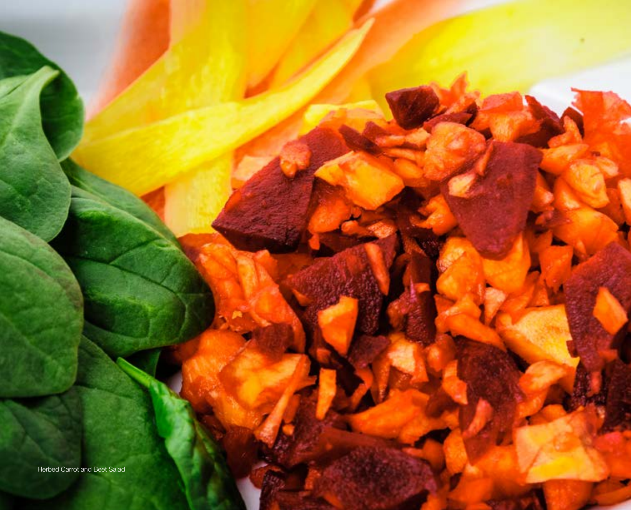
Herbed Carrot and Beet Salad