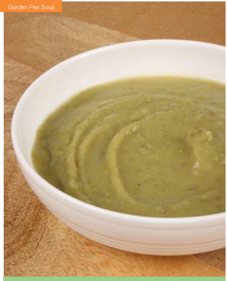
Garden Pea Soup

To a saucepan, add 4 cups of the broth. Add potatoes, peas, and shallots and cook until potatoes are tender. Place all ingredients, including remaining broth and lemon zest, into blender and blend for 30-45 seconds until smooth. Serve warm. Serves 2-4.