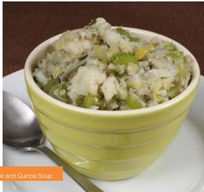
Vegetable and Quinoa Soup

Preheat oven to 350 F. Rub potatoes with 1 tablespoon olive oil and place on baking sheet. Wrap a head of garlic in aluminum foil and place on baking sheet with potatoes. Bake for 30 minutes or until potatoes are soft. Heat remaining oil in a medium sauté pan with the onion until onion is translucent, about 3 minutes. In a blender or food processor, add onion, garlic, and about half of the potatoes. Purée mix thoroughly. Transfer to a large soup pan and add all remaining ingredients. Heat to a boil, then lower heat and allow to simmer for about 15 minutes. Serves 4.