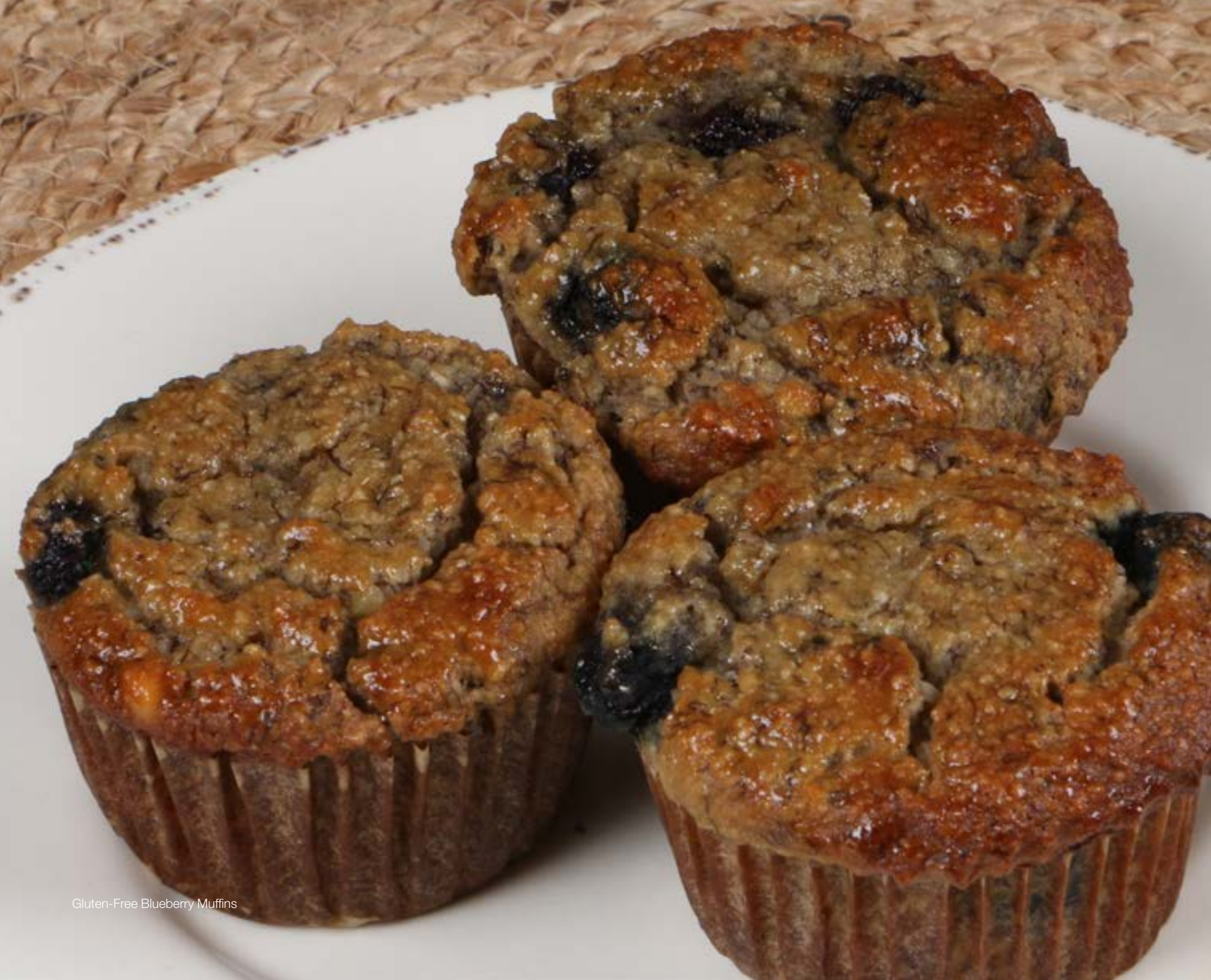
Gluten-Free Blueberry Muffins